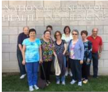
And the Dennis & Phillip Ratner Museum